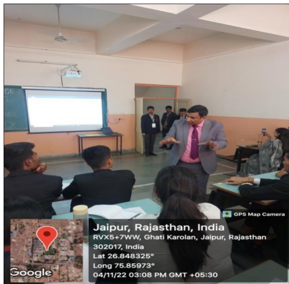
Jaipur, Rajasthan, India RVX5+7WW, Ghati Karolan, Jaipur, Rajasthan 302017, India Lat 26.848325° Long 75.85973° 04/11/22 03:08 PM GMT +05:30