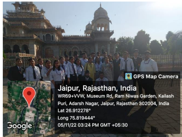
Fig. Glimpse of Two Days Conferences