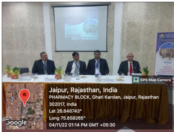
Jaipur, Rajasthan, India PHARMACY BLOCK, Ghati Karolan, Jaipur, Rajasthan 302017, India Lat 26.848743° Long 75.859265° 04/11/22 01:14 PM GMT +05:30