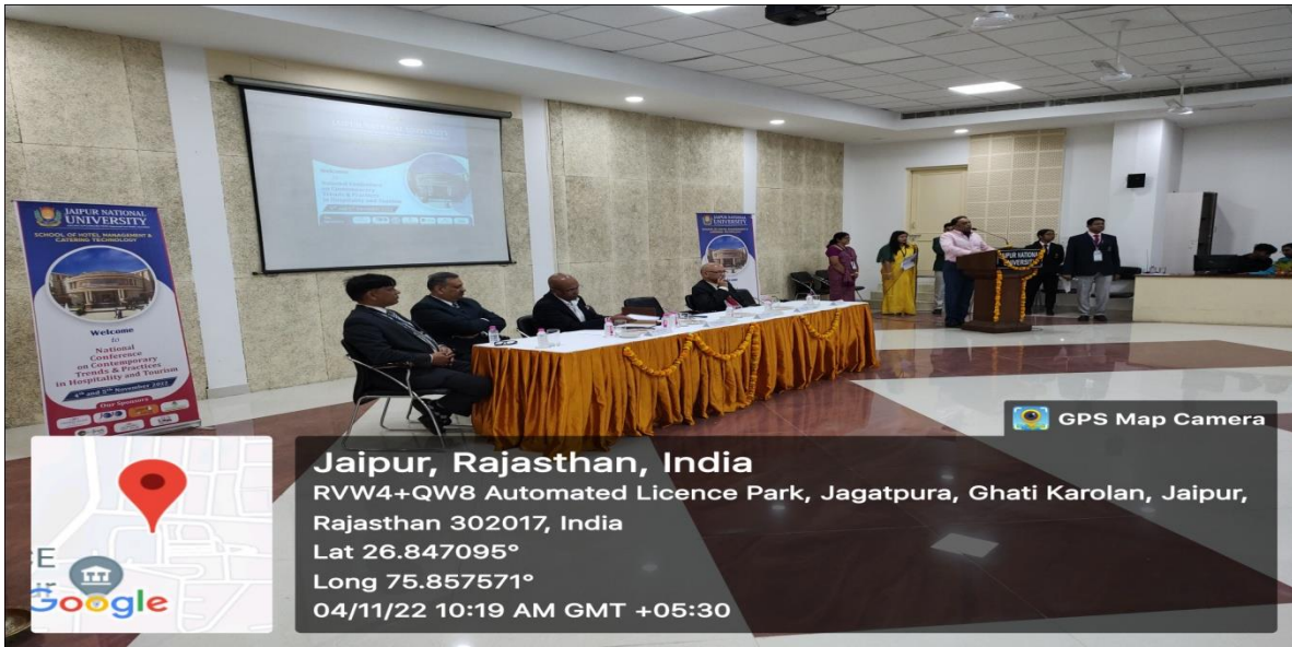
Jaipur, Rajasthan, India RVW4+QW8 Automated Licence Park, Jagatpura, Ghati Karolan, Jaipur, Rajasthan 302017, India Lat 26.847095° Long 75.857571° 04/11/22 10:19 AM GMT +05:30