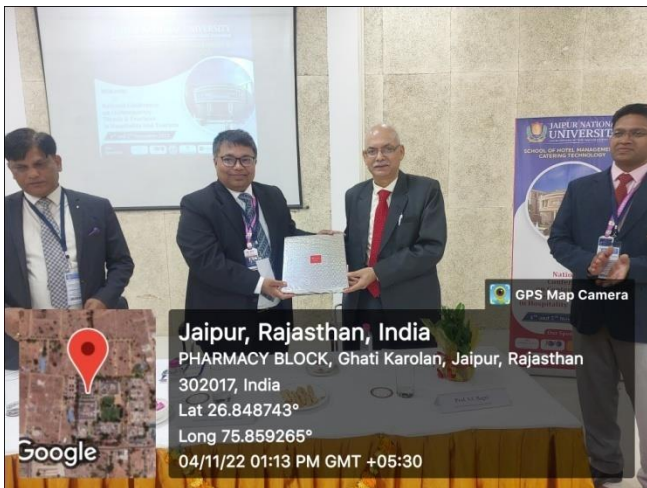
Jaipur, Rajasthan, India PHARMACY BLOCK, Ghati Karolan, Jaipur, Rajasthan 302017, India Lat 26.848743° Long 75.859265° 04/11/22 01:13 PM GMT +05:30